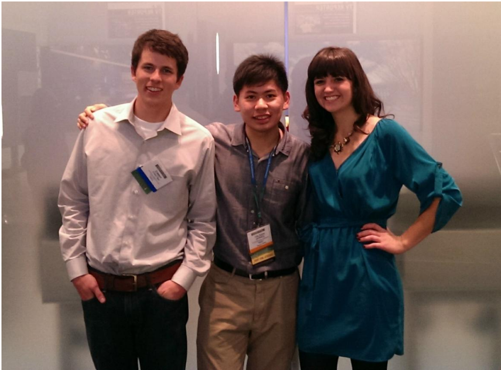
A photograph with fellow student poster competition participants at the Newseum night party

successfully organized year after year so future batches of young minds could benefit from this unique and broadening experience.