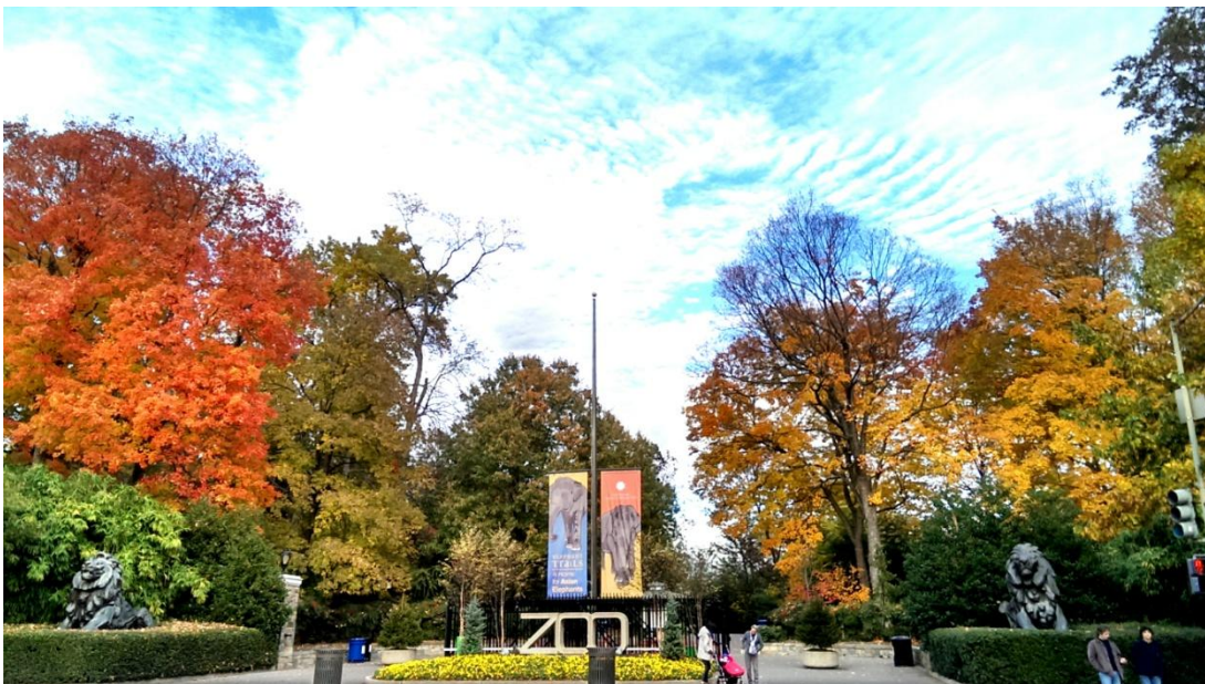
The alluring autumn hue

After a long and tiring flight (with a roundabout journey from Singapore to Hong Kong, then Chicago before flying in to Washington D.C.), I set foot in Washington D.C. for the first time. The city was extremely beautiful and the autumn hue added a nice touch to everything. It redefined my perception of an urban city: lush greenery, sprawling skylines and brilliant architecture were everywhere. I quickly flagged down a cab and headed straight to the hotel after landing in the Reagan National Airport.