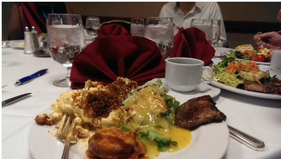
The sumptuous spread of food at the Young Professionals/Student Luncheon and Orientation

One of the first few events I attended was the Young Professionals/Student Luncheon and Orientation. We were greeted with a sumptuous spread of food and the committee planned some exciting teambuilding games and exercises for us to network with the other participants and representatives from different industry players like FDA and other pharmaceutical companies. This was a great opportunity for me to get to know fellow student representatives and how other Student Chapters operate. From conversing with representatives from the other Student Chapters, I learnt that one common problem faced by them was the challenge in retaining their members and the high turnover rate that resulted. Chapter presidents shared advice, problems and even solutions. Being able to be a part of such a discussion was enriching and enlightening.